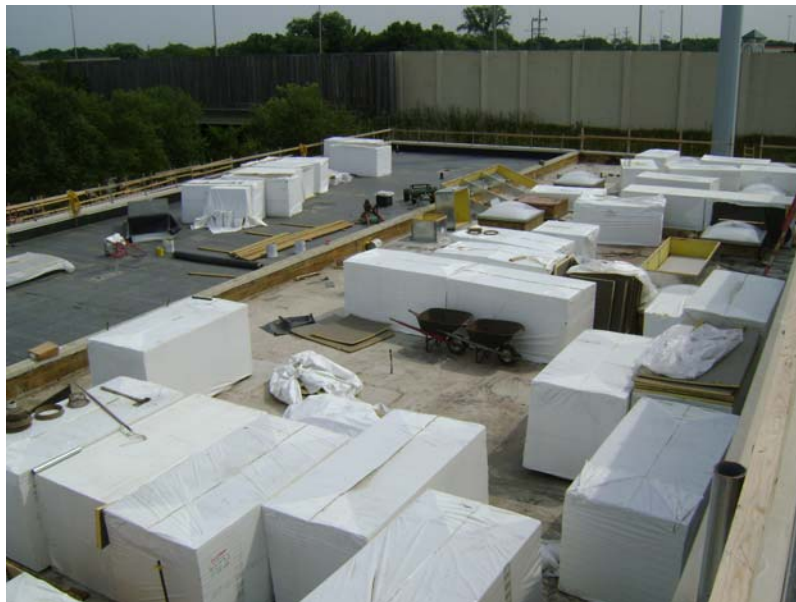
Office and Existing Service Building Roofs