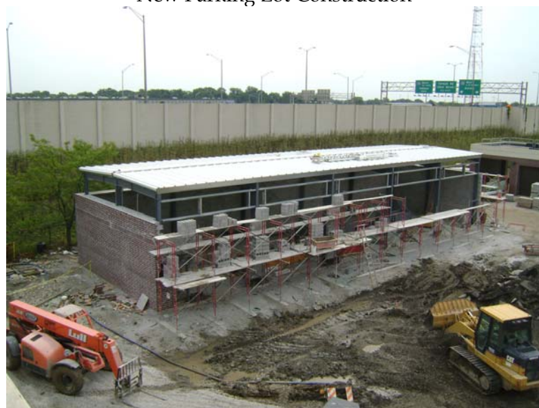
New Garage Construction Progress