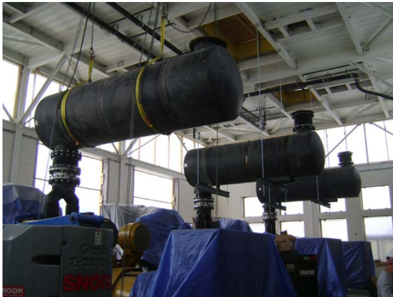
Installation of Silencers for Generators