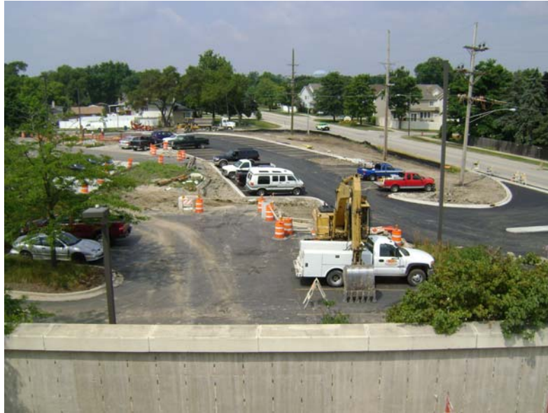
New Parking Lot Construction