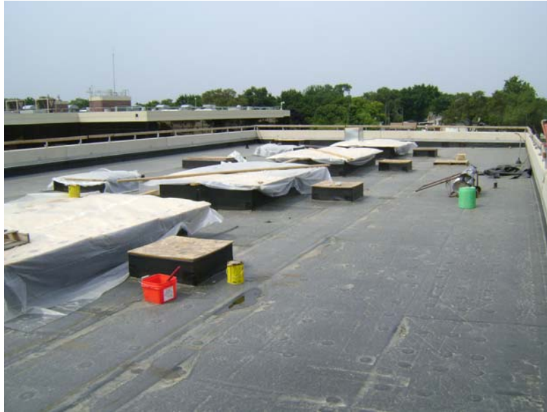
Generator Building Roof