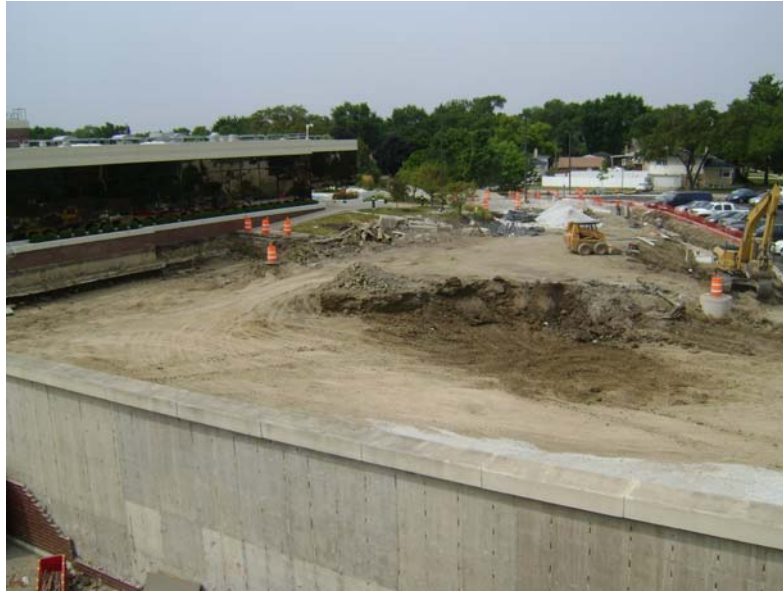
Excavation of Upper Parking Lot