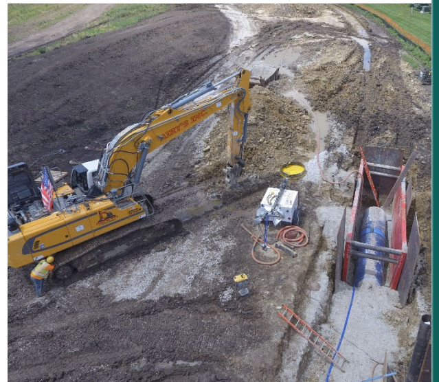
Excavation along Book Road; Excavation near Wolf's Crossing & 95 th Street