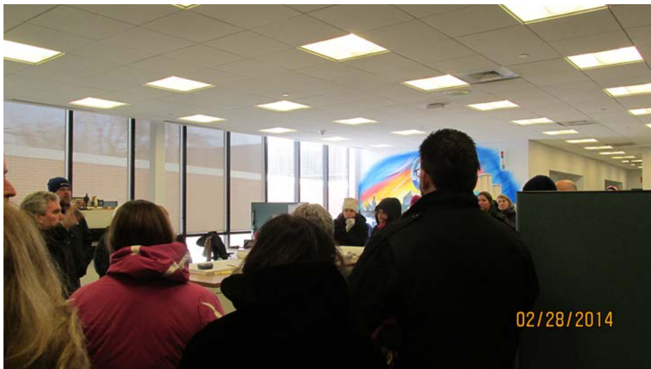
The teachers viewing the LEED generator building administrative office