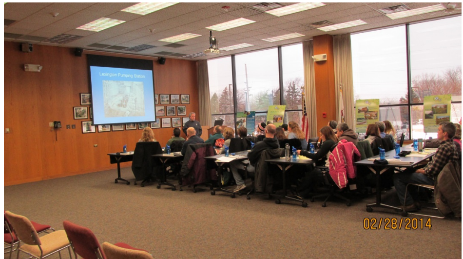
Terry McGhee discussing the Lake Michigan to DWC Water Journey

The promotional materials that DWC hands out at events were given to the teachers to use in their classrooms to promote water conservation. These items included: water bottles, shower timers, rain gauges, leak detection tablets, magnets, and educational handouts. DWC's full rain barrel display and dual flush toilet display were both present.